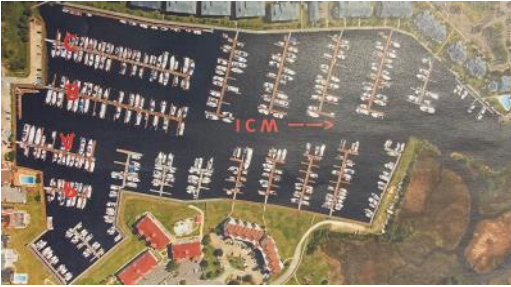
OVERHEAD SHOT OF COQUINA HARBOR AND MBYC