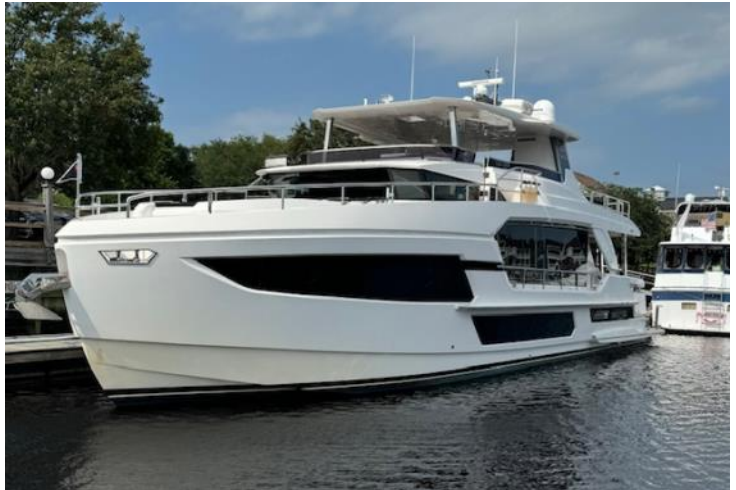
2021 75' Horizon MV Inizio on the fuel dock.