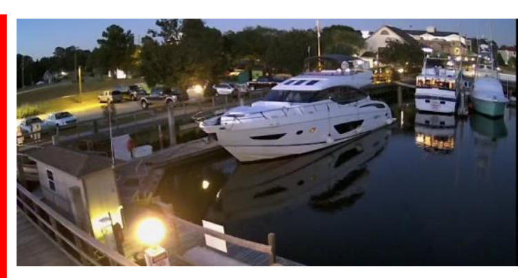
72' GOLDEN DAZ II Passing through headed south... transient season is in full swing!