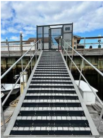
NEW GANGWAY TREADS