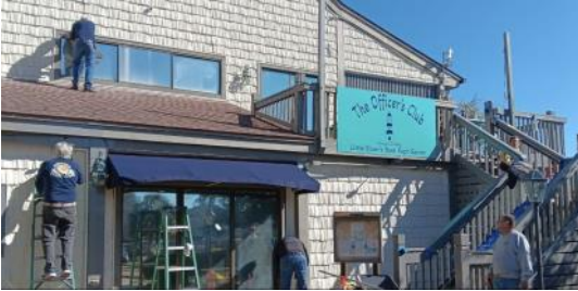
Staff painting trim on the building in January, making a difference and other projects ongoing before boating season.