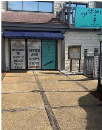
New Signage as you come in from the parking lot.